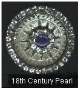
18th Century Pearl

Buttons have been in use for hundreds of years. In very early times, clothing was fastened with ties or pins, but gradually toggles and buttons as we know them came to be in use. Many ancient burials have included buttons or button-like objects. In the Early and Middle Bronze Age, large buttons were primarily used to fasten cloaks. By the 13th century, buttons were widely in use, mainly as decoration. As most clothing of that time period was closed with lacing or hooks, garments didn't use buttons as methods of closing on a regular basis until the last half of the 16th century. Most of the buttons from this time period were small, but over the next century or so they became larger and very ornate, often using precious metals and jewels. During the 17th and 18th Century, most buttons were worn by men.