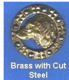
Brass with Cut Steel

Throughout the years, the decorations on buttons have reflected both the fashion and passions of the time. Nearly everything has been pictured on a button. Animals are one of the most popular subjects, along with plant life and objects like belt buckles and hats. Some buttons are shaped like the item they portray, and are known as “realistics” for their realistic appearance. Others simply had the design engraved, stamped, painted or enameled on the surface of a conventionally shaped button. Many of the antique buttons feature very detailed paintings in miniature.